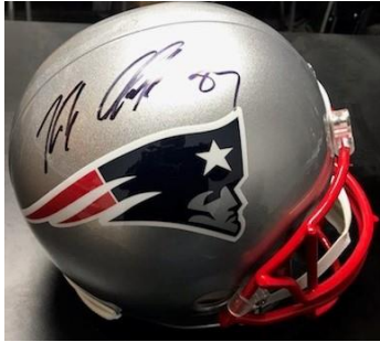
Rob Gronkowski Full size autographed Football helmet Hologram certified authentic